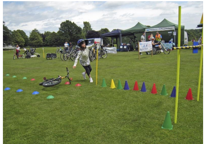
Too many cones?