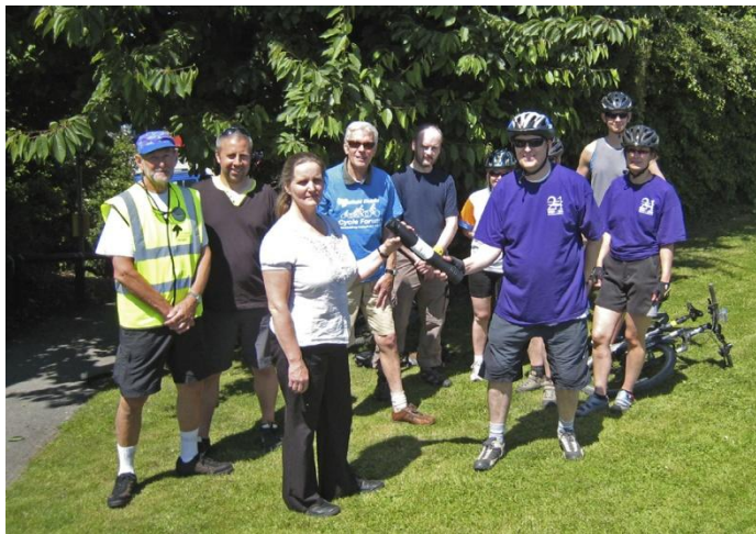
Receiving the baton at the Leeds/Wakefield border

We also ran some guided rides around the grounds at Nostell and further afield to Anglers Country Park. Around 30 people joined in the rides with a number of family groups participating. Most participants made use of the bikes we purchased with grants from the NHS and Community Foundation. We are beginning to see a number of these families return to our events and there is evidence to suggest that some of them have become regular cyclists after having started with one of our guided rides.