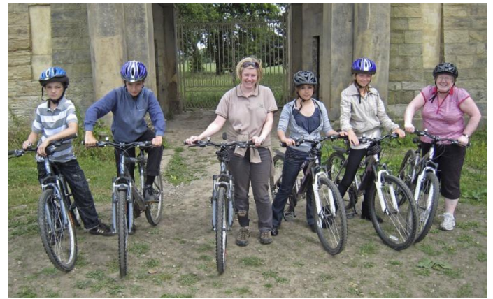
Young riders on a guided ride in Nostell Parkland

The anniversary celebrations concluded with a festival in Barnsley on Sunday 20 th June. Unfortunately we were unable to join the celebrations as we were all busy at Nostell Priory with our own big Bike Week Festival.