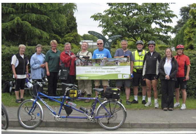
Handing over the baton to walkers at the Barnsley border