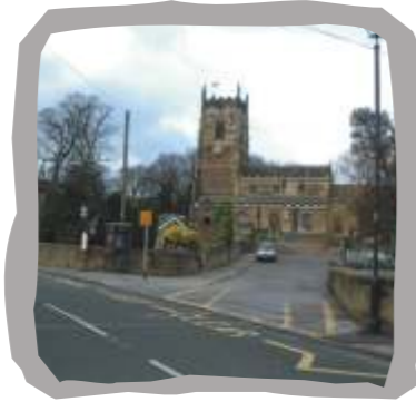
Badsworth church (Waymarker 2)