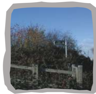
Hemsworth Bypass (Waymarker 4)