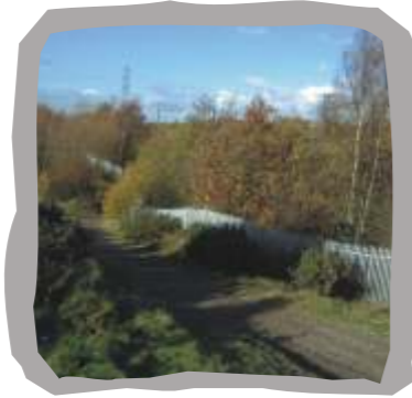
Railway perimeter fence (Waymarker 9)