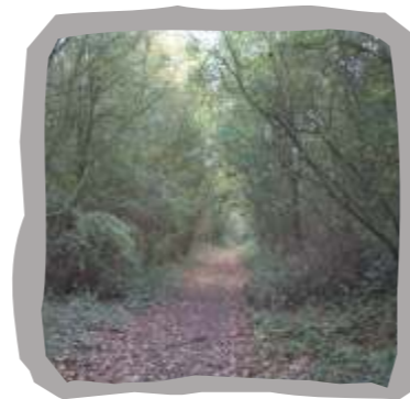
Disused Railway, avenue of trees (Waymarker 11)