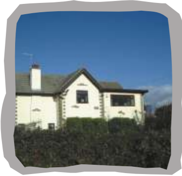
House at end of bridleway (Waymarker 6)