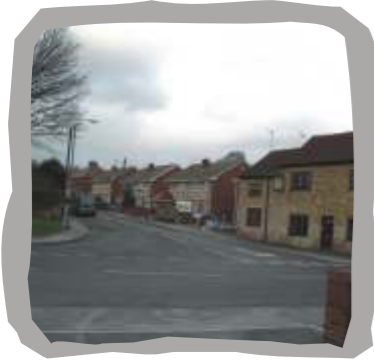
Junction of High Street, Upton & Field Lane (Waymarker 1)