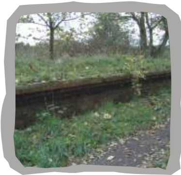
Former railway station platform (Waymarker 12)