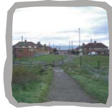
Tom Wood Ash Lane (Waymarker 14)