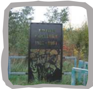
Upton Colliery (Waymarker 13)